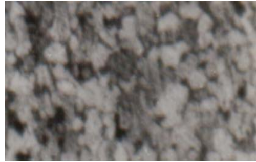
Plate 6: 6mm thick at 1.2mm/sec.