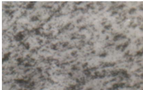
Plate 3: 4mm thick at 4mm/sec.