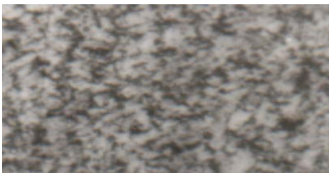
Plate 4: 4mm thick at 7.5mm/sec.