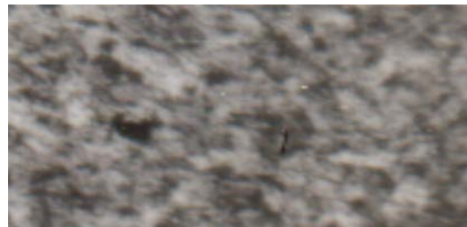
Plate 9: 12mm thick at 6.2mm/sec.