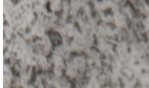
Plate 7: 12mm thick at 5.5mm/sec.