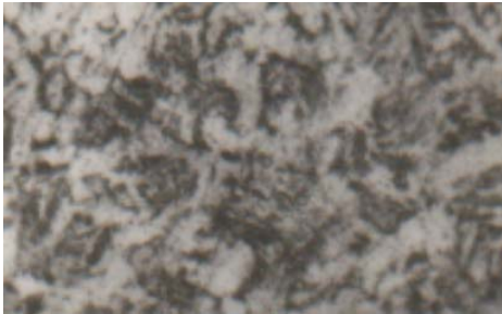
Plate 2: 2mm thick at 3.14mm/sec.