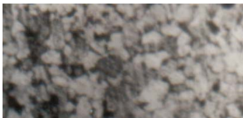
Plate 5: 6mm thick at 2.83mm/sec.