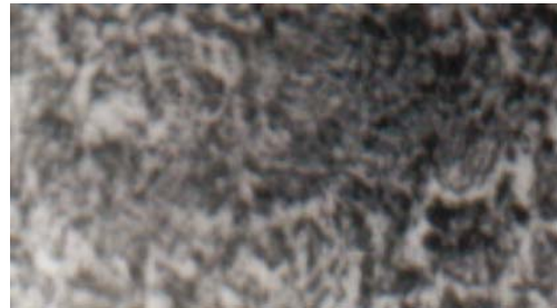
Plate 8: 12mm thick at 1.3mm/sec.