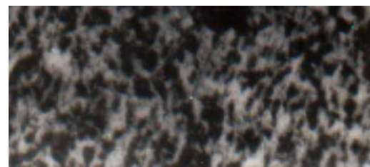
Plate 10: 12mm thick at 1.3mm/sec.