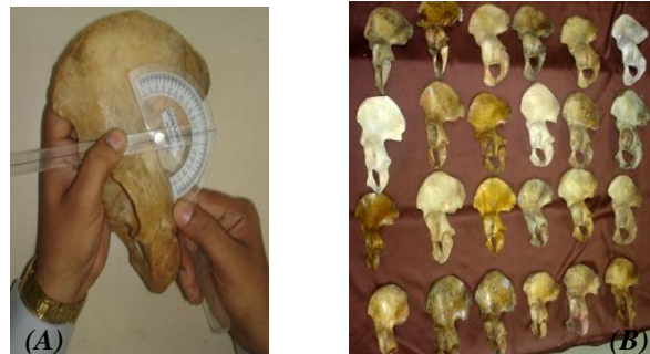
Figure 1: (A) Showing the Measurement of Angle between PIIS-IS using Protractor (B) Hip Bone Samples.

using the Statistical Package for the Social Sciences (SPSS). The graph was drawn using Microsoft Excel (Table 1).