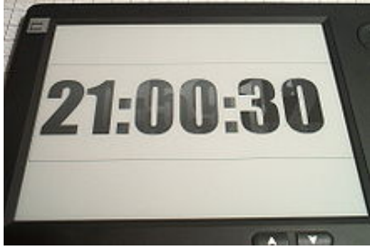
Figure 4: An E-ink Showing the Ghost of a Previous Image (Source: Wikipedia, 2010).