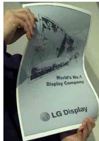
Figure 3: LG Debuts E-paper.

Other research efforts into E-paper involved using organic transistors embedded into flexible substrates (Huitema, et al., 2001 and Gelinck, 2004) including attempts to build them into convectional paper (Anderson, et al., 2002). Simple color E-paper consists of a thin colored optical filter added to the monochrome technology. The array of pixels is divided into triads, typically consisting of the standard cyan, magenta and yellow in the same way as CRT monitors. The display is then controlled like any other electronic color display.