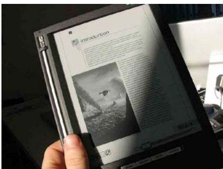
Figure 2: iLiad E-Book Reader Equipped with an Electronic Paper Display (Source: Wikipedia, 2010).

Some notable features of E-paper technology includes the following (Bridgestone Corporation, 2010):