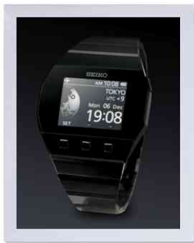
Active Matrix EPD watch