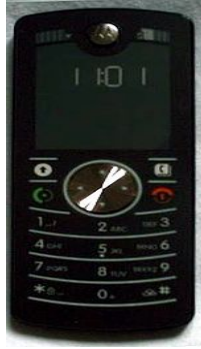
Figure 5: The Motorola F3 uses an E-paper display instead of an LCD (Source:Wikipedia, 2010).