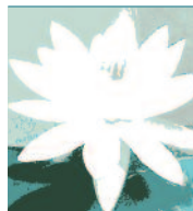
Water Lily ( nymphaea )

Symbolizes an openness to new opportunities for health, healing and spiritual growth.