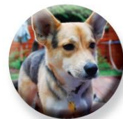
Energy Medicine Small Animal Program

Goal: The Certificate Program is offered to support individuals desiring to work with animals and or assist others to do the same through using energetic approaches with animals either large and/ or small animals or both large and small animals.