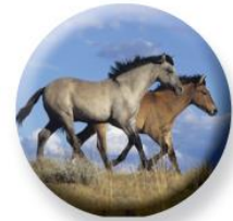
Energy Medicine Equine Program

Description: This Certificate Energy Medicine Animal Specialist Training is designed for those persons interested in a professional training certificate program establishing your credentials in this field. The program works with background, expertise and interest in working with animals either large or small or both to help them and their companions to be knowledgeable in Energy Therapy.