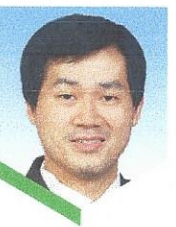
Lukui Chen Integrated Hospital of TCM, China