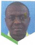
Kamaka Kassimu Ifakara Health Institute, Tanzania, United Republic of