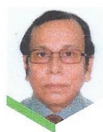
Mohanlal Ghosh Hooghly Mohsin College, India