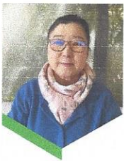
Hideko Pelzer Acupuncture and Integrative Medicine College, United States