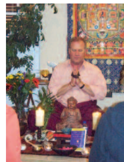
The Medicine Buddha hanging at THC