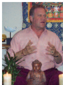
Lama Surya Das at THC

One of the highlights of 2009 was the blessing of renown spiritual Buddhist Western spiritual leader, Lama Surya Das teaching from the Triangle Holistic Center in Durham, NC headquarters for Energy Medicine Partnerships International. His wisdom and energy added to the ambiance laid by the other spiritual teachers New Zealand